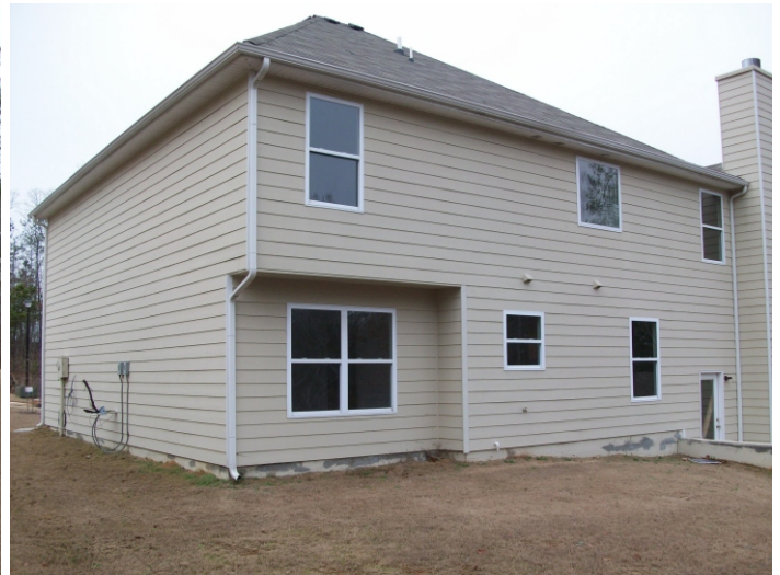
Description: A general view of the building exterior from the west (top left); from the northeast (top right) from the south (bottom left); from the east (bottom right)