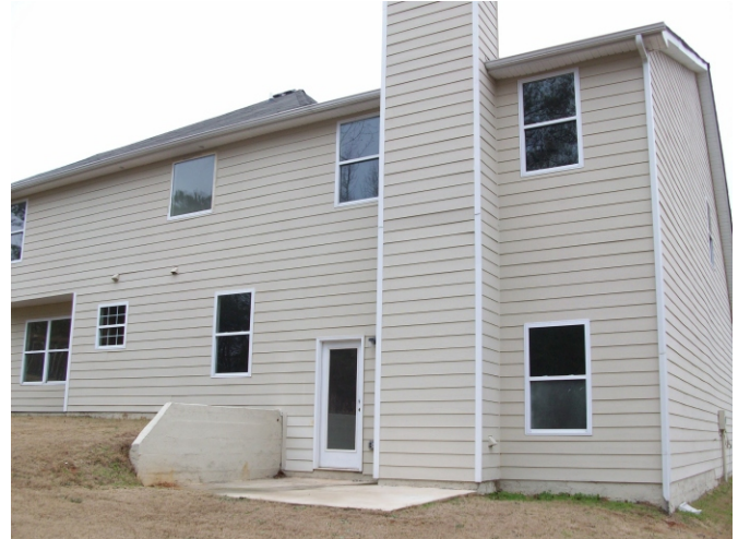
Description: A general view of the building exterior from the west (top left); from the southwest (top right); from the southeast (bottom left); from the east (bottom right)