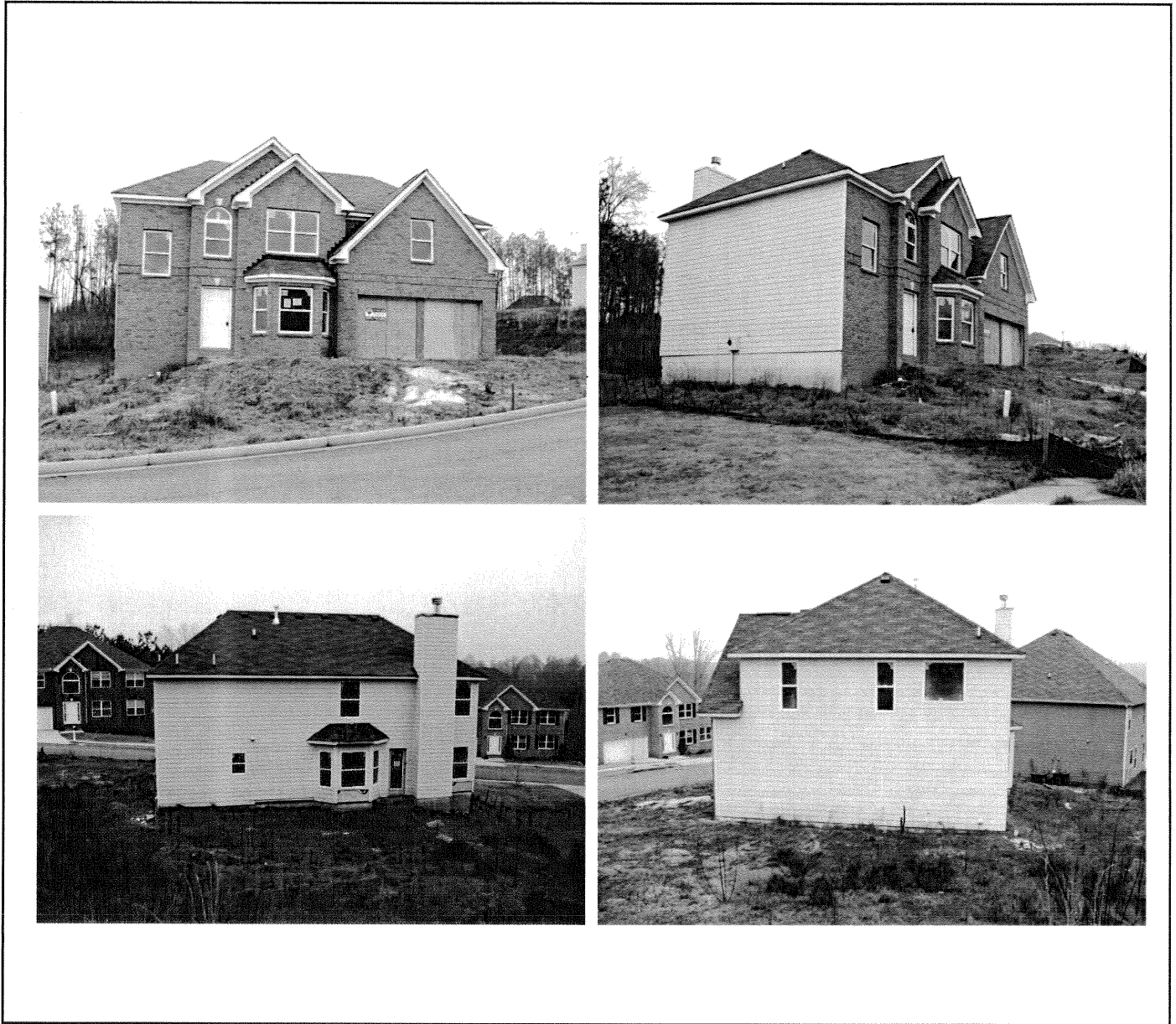
Description: A general view of the building exterior from the east (top left); from the south (top right); from the west (bottomleft); from the north (bottom right)