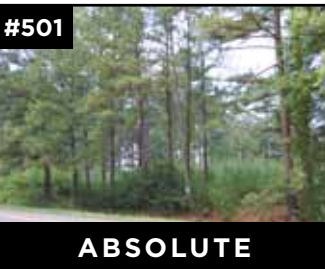
#501 1177 Martling Road, Albertville 2.66± acres of residential development land.

AUCTION LOCATION: Hampton Inn, Guntersville, AL REGISTRATION TIME: 2:00 PM AUCTION TIME: 3:00 PM