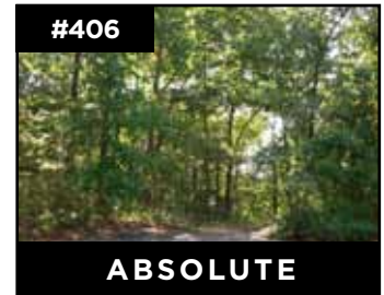
#406 Fairway Lane, Pinson Cumberland Hills Subdivision. 3 residential lots, selling as an entirety.