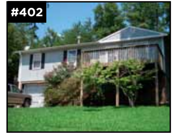
#402 2903 Creek Lane, Pinson 3 bedroom, 2 bath home with basement.