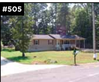
#505 260 Cottonwood Circle, Boaz 3 bedroom, 2 bath home