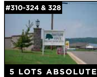
#310-324 & 328 16 residential lots in the Baylor Cove Subdivision of Hanceville.