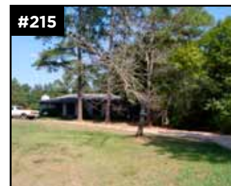
#215 312 George Drive, Decatur Occupied 3 bedroom, 1 bath home