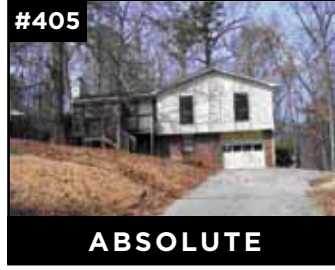
#405 5878 Dug Hollow Road, Pinson 3 bedroom, 2 bath home