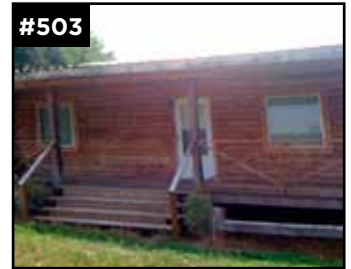
#503 3685 & 4103 Cathedral Caverns, Woodville Commercial property, 2 cabins and a 10 hookup RV campground