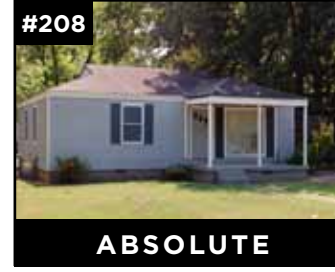
#208 1913 7th Street SE, Decatur 2 bedroom, 1 bath home with a large front yard and covered porch.