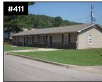
#411 Villa Court, Oneonta 14 apartments. 93% occupied. $7,900 monthly gross income.