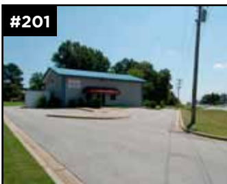
#201 1100 Hwy 31 SW, Hartselle Road frontage on Hwy 31. Formerly a tobacco shop. Large parking area.

AUCTION LOCATION: Courtyard Marriott, Decatur, AL REGISTRATION TIME: 9:00 AM AUCTION TIME: 10:00 AM