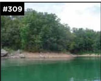
#309 157 Co. Rd. 891, Crane Hill 1.1± acre residential lot #115 with 140± ft. of water frontage. Located in Blue Water Estates on Smith Lake.