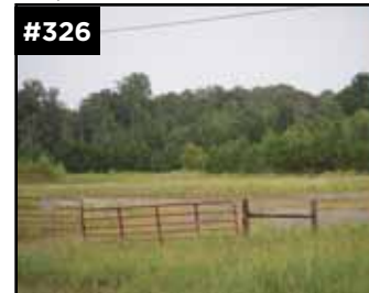
#326 Hwy 157, Cullman 23± acre industrial tract off Hwy 157.