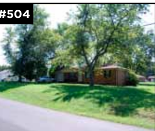
#504 1033 Portwood Drive, Albertville 3 bedroom, 1 bath home