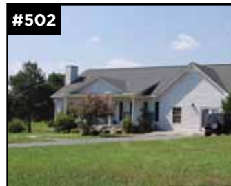
#502 3160 Highpoint Road, Albertville 3 bedroom, 2 bath home