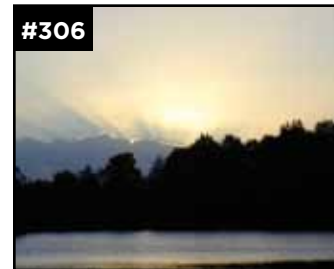
#306 Co. Rd. 332, Crane Hill 34± acre residential development land with 1,200± ft. of water frontage. Located in Miller Cove on Smith Lake.