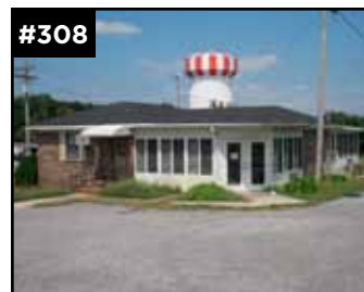
#308 18260 Hwy 31 N, Vinemont Commercial building that was once occupied by a beauty shop.