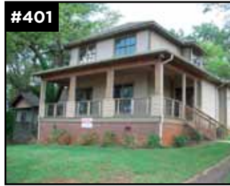
#401 3901 3rd Avenue S, Birmingham 4 bedroom, 2.5 bath home on Lot #20.

AUCTION LOCATION: Covered Bridge Inn & Suites, Oneonta, AL REGISTRATION TIME: 9:00 AM AUCTION TIME: 10:00 AM