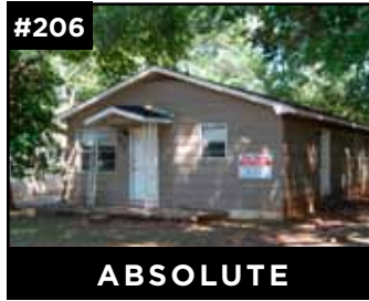
#206 318 12th Avenue NW, Decatur 3 bedroom, 1 bath home