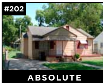
#202 104 6th Avenue NW, Decatur 2 bedroom, 1 bath home.