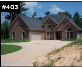
#403 7625 Aspen Ridge Lane, Pinson 3 bedroom, 2 bath home. Located in the Aspen Ridge Subdivision.