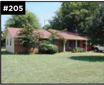
#205 1018 Hillwood Drive SW, Decatur 3 bedroom/2 bath home