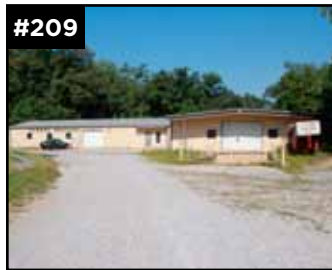
#209 924 Shoal Creek Road, Decatur Commercial building with 2 baths, kitchen, roll-up doors, and loading dock.