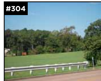
#304 1st and 2nd Ave SW, Cullman Lot #2. Zoned Commercial