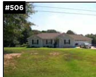
#506 239 Friendship Road, Boaz 3 bedroom, 2 bath home