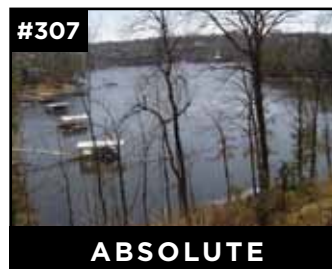
#307 47 Co. Rd. 898, Crane Hill 1± acre residential lot #51 with 128± ft water frontage. Located in Blue Water Estates on Smith Lake.