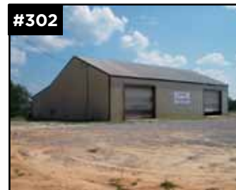
#302 7300 Co. Rd. 1082, Vinemont Located in the Battleground Community off Hwy 157N.

AUCTION LOCATION: Cullman Civic Center REGISTRATION TIME: 2:00 PM AUCTION TIME: 3:00 PM