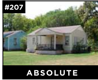
#207 221 8th Avenue NW, Decatur 2 bedroom, 1 bath home in the Buena Vista Subdivision of Decatur.