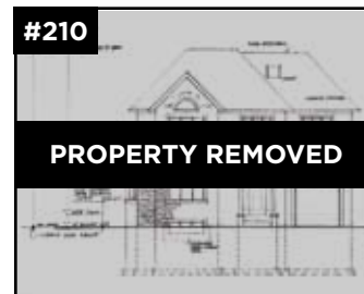
#210 PROPERTY REMOVED