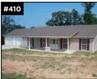
#410 154 Kristen Drive, Hayden New 3 bedroom, 2 bath home in Section 5 of Misty Acres.