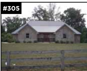
#305 7459 Co. Rd. 109, Bremen 3 bedroom, 2.5 bath home with screened porch, and pool.