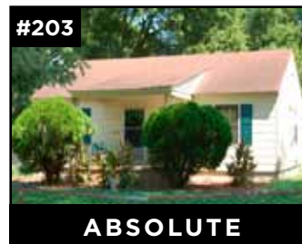
#203 106 6th Avenue NW, Decatur 2 bedroom, 1 bath home.