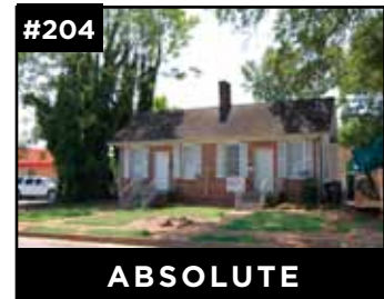
#204 519 Vine Street SE, Decatur Residential duplex