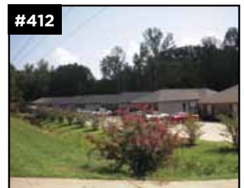
#412 Stonebrook, 7000 2nd Avenue W., Oneonta 20 apartments. 100% occupied. $12,050 monthly gross income.