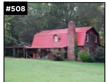
#508 1458 Arley Lacey Road, Boaz Single family home