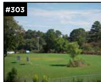
#303 1st and 2nd Ave SW, Cullman Lot #1. Zoned Commercial