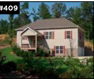
#409 1153 Deans Ferry Road, Hayden New 3 bedroom, 2 bath home