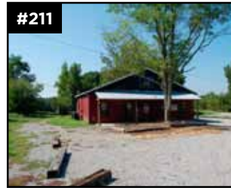
#211 848 Apple Grove Road, Union Grove Formerly a restaurant