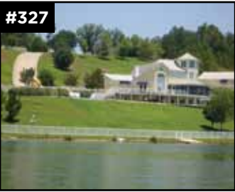
#327 1235 Co. Rd. 294, Cullman 8 bedroom, 6 bath waterfront home on 2.3± acres.