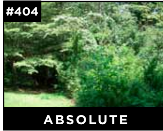
#404 6034 Elm Avenue, Pinson Wooded, residential lot #27