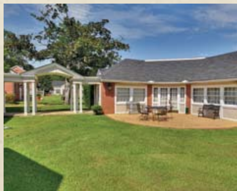
Village at Coalson is comprised of six brick cottages with Georgian Revival architecture.