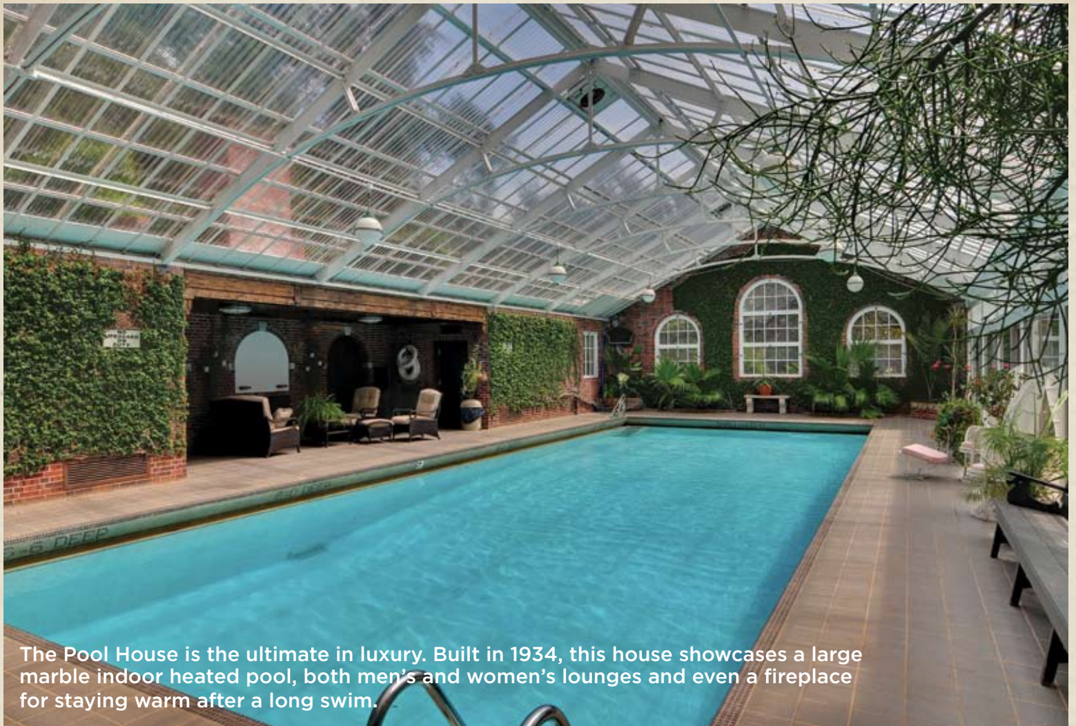
The Pool House is the ultimate in luxury. Built in 1934, this house showcases a large marble indoor heated pool, both men's and women's lounges and even a fireplace for staying warm after a long swim.