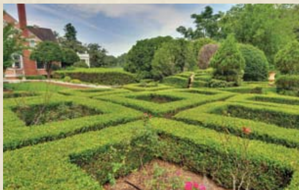
Among the most stunning views of the Coalson Plantation is its grounds and landscaping. Along with the beautiful oak and magnolia trees draped with Spanish moss, the property also has formal boxwood gardens, rose gardens and peacocks that roam the grounds.