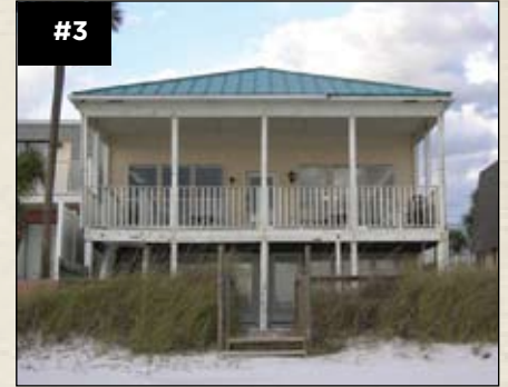
#3 7905 Surf Drive Panama City Beach, FL 32408

Located in beautiful Destin, Florida, this property has wonderful gulf views and commercial potential. This fourplex offers 2 two-bedroom, two-bath units and 2 one-bedroom, one-bath units, making it ideal for weekend retreats or vacation residences. With open layouts, the condo units present great rental opportunity. An onsite pool and close beach proximity affords great entertainment options.