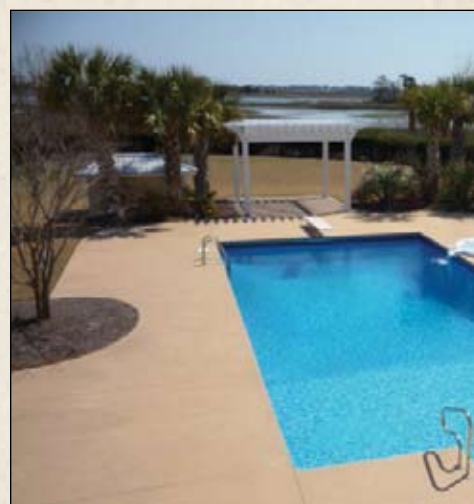
VIEW FROM 105 WINDLASS COURT, WILMINGTON