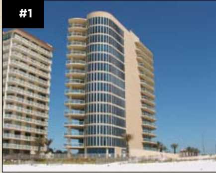
#1 25040 Perdido Beach Boulevard #1 Orange Beach, AL 36561

The resort cities of Orange Beach, Panama City Beach, Destin, Navarre Beach, and Santa Rosa Beach are all located along the breathtaking white sand beaches that are characteristic only of the Alabama and Florida Gulf Coast. Tourists and second home seekers flock annually to these destinations to enjoy the sparkling Gulf waters and stunning beaches. The Gulf Coast offers guests and residents an array of opportunities including fantastic boating, fishing, swimming, golfing, and annual festivals that occur all year-round. An abundance of dining and nightlife options compliment the easy-going lifestyle of living in these fantastic waterfront locations.