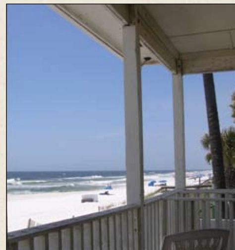
VIEW FROM 7905 SURF DRIVE, PANAMA CITY BEACH