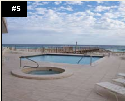
#5 8269 Gulf Boulevard #202 Navarre Beach, FL

Located in the Sanctuary at Redfish, this 3 bed, 3.5 bath penthouse unit provides amazing views of the coastal dune lake and the Gulf of Mexico. Features 10' ceilings, granite countertops, crown molding & covered balcony. Floor-to-ceiling windows, tile floor, columns & an urban kitchen add to the character this unit exudes. This community is a gated community offering residents a host of amenities including a spa treatment room, indoor virtual golf, fitness facility, pool deck with waterfall pools, hot tubs, cabanas, fire pit & a boat shuttle to the beach.