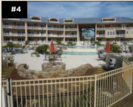
#4 1653 West Highway 30-A Unit 3112 Santa Rosa Beach, FL 32459

Enjoy breathtaking sunsets from either two decks on this beautiful beach home. With 5 bedrooms and 5.5 baths, this waterfront home has an open floor plan perfect for guests or entertaining. A large kitchen with island opens up to the living room, which looks out onto the Gulf of Mexico. A laundry room is available on both levels and a two-car attached garage makes for ease and convenience.