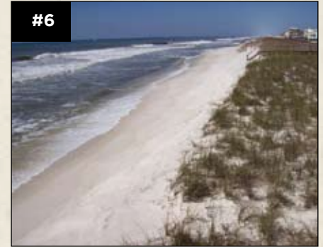
#6 Lot 9 Gulf Boulevard Navarre Beach, FL 32566

On the second floor of the Belle Mer Condominium building, this 3 bedroom, 3 bath gulf front condo has amazing views of the water and the pool deck. Features 9' ceilings, tile floors in the great room and kitchen, maple kitchen cabinets, butcher-block kitchen countertops, tiled balcony, and much more. This living area is ideal for vacation living or a permanent residence. Residents at Belle Mar enjoy a host of amenities including a pool, covered parking, tennis court, community room, exercise room, and more.