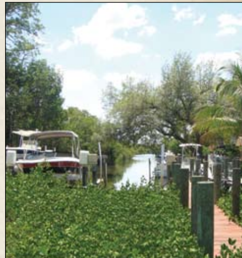
VIEW FROM 1316 GRAND CANAL DRIVE, NAPLES