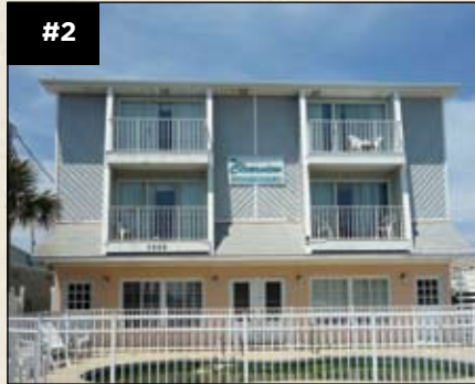
#2 1656 Scenic Gulf Drive Destin, FL 32566

Located in a 14-story tower in desirable Orange Beach, this 5 bedroom, 5.5 bath condo has direct gulf view and offers a relaxing and serene environment. The condo features a Subzero refrigerator, wine cooler, designer cabinetry, natural stone flooring, granite countertops, amazing floor-to-ceiling glass windows, fireplace, and more. Residents can enjoy an indoor pool, outdoor pool, spa, exercise room, common lobby, and barbecue area.