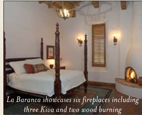
La Baranca showcases six fireplaces including three Kiva and two wood burning