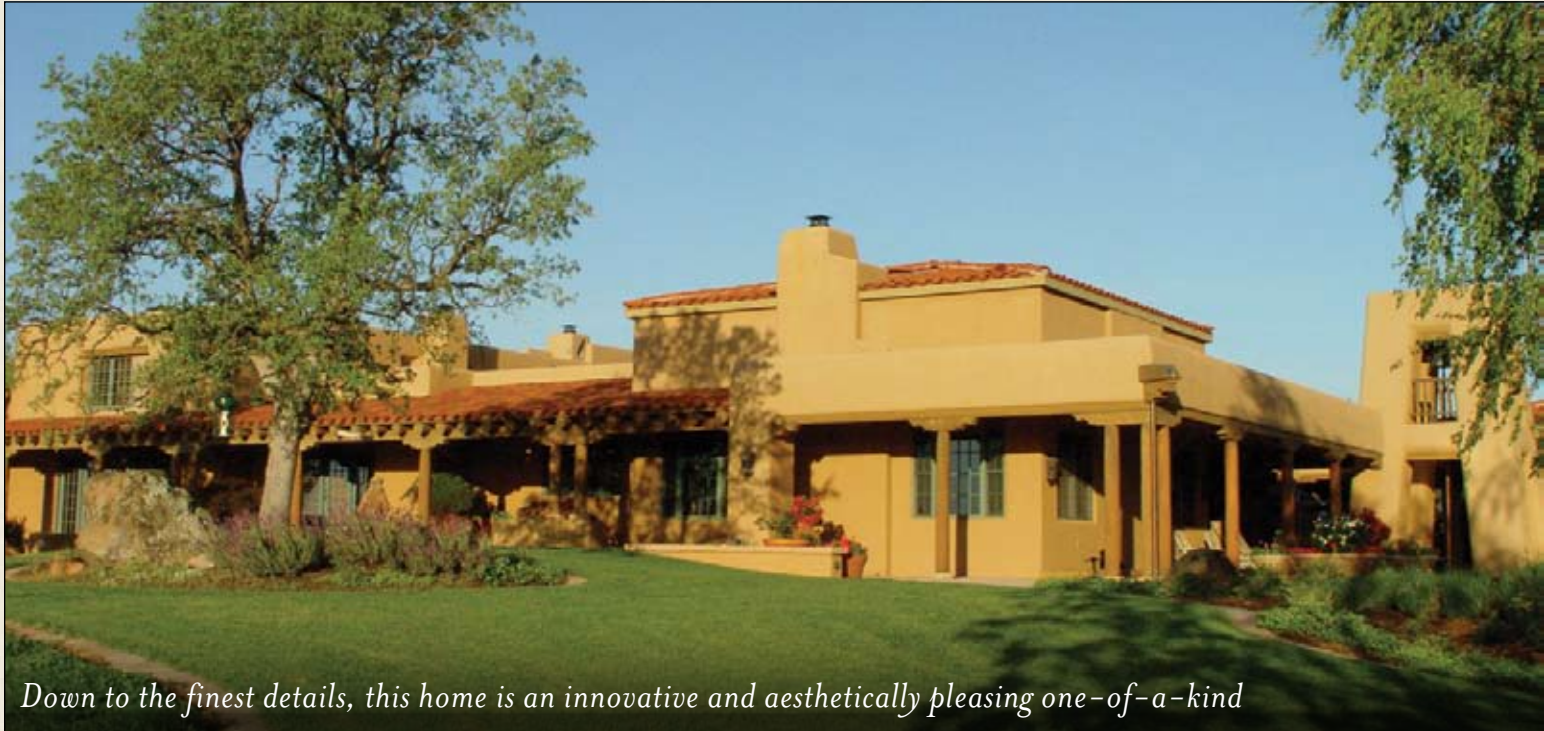
Down to the finest details, this home is an innovative and aesthetically pleasing one-of-a-kind

Southwest mission style home situated atop a mesa overlooking an expansive valley with views of Mt. Shasta and Mt. Lassen