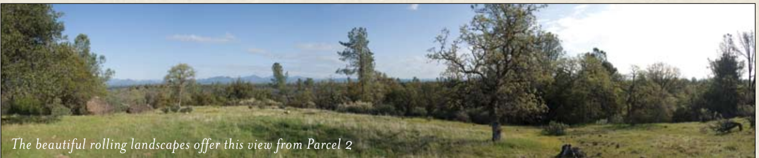
The beautiful rolling landscapes offer this view from Parcel 2

Outdoor enthusiasts have access to a number of activities. A short drive to Mount Shasta provides the perfect place to hit the slopes or spend an afternoon cross country skiing. Lake Shasta is only minutes away where you can enjoy boating and watersports. In addition, there are several golf courses within minutes of La Baranca and the surrounding valley.